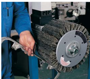
Model 12P6 used on aluminium casing.

Sanderheads are available in three sizes with various cutting widths of abrasive. The 8P and the 12P models are normally driven by a bench or floor type spindle stand whilst the lightweight 6P1 and 6P2 models can be used with hand held portable and flexible power tools. The Sanderhead is constructed as a quality product and all parts which are subject to abrasive wear can easily be replaced.