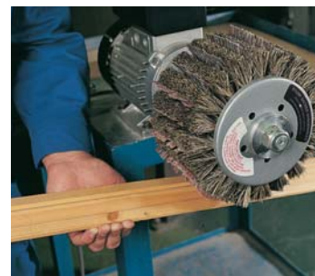
Model 8P4 used on wood moulding.