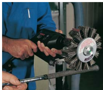
Model 6P1 used on rubber golf club handle.